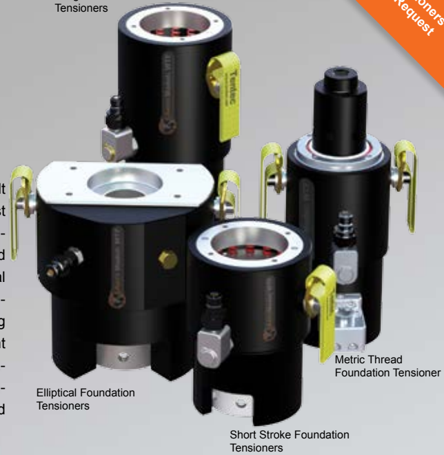
Elliptical Foundation Tensioners