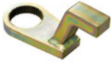
Standard (comes with tool) Part No: 10686