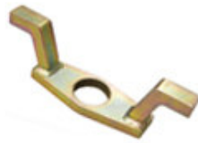
Double Ended Arm Part No: 10688