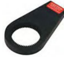
Blank Part No: 13364