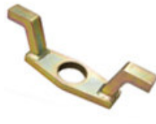
Double Ended Arm Part No: 13368