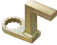
Deep Socket Part No: 13367