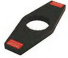
Double Ended Blank Part No: 13365